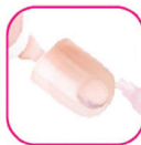
STEP 2 Apply a generous amount of adhesive to rear portion of nail.