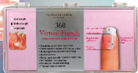
360 Nails, 12/Sizes